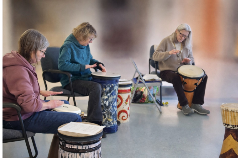
Drumming for Everyone Class